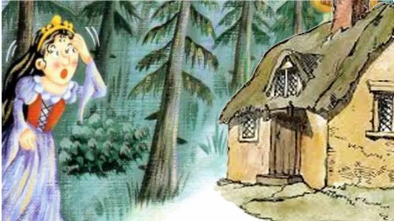
Snow White ran through the forest and found a little house.